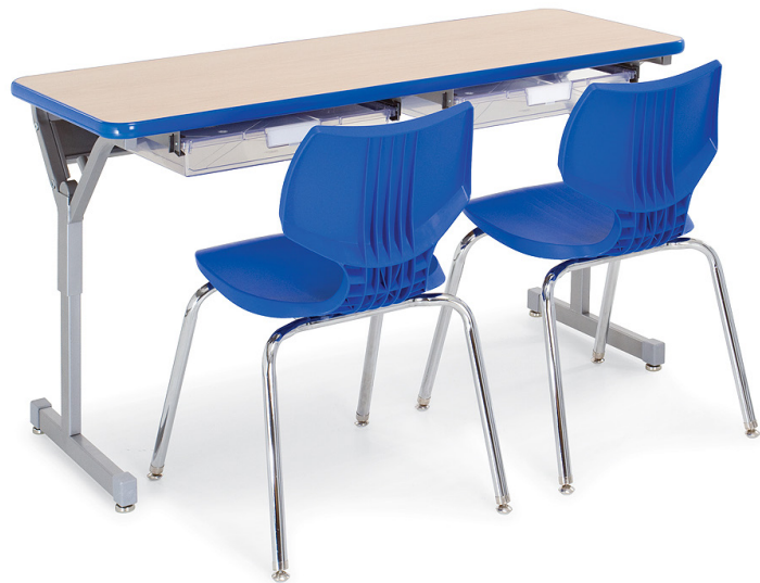
model #01361 (20"x60") shown with optional SW tote trays #30926 and Flavors Stack Chairs #11849.