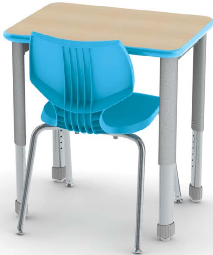
Interchange 20"x27" #04080 Shown in Blond Echo top with Cerulean edge and Platinum frame.