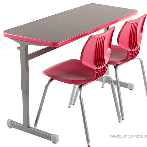
*MODEL 01660 ADJUSTABLE 19"-31"H SHOWN