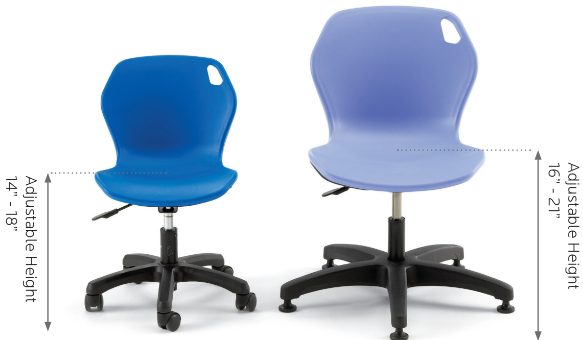
Model 00532 (glides) Model 00533 (casters) B Shell Adjustable