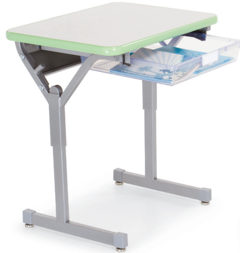
model #01360 (20"x27") single-student flex desk shown, with optional Cascade Storage tote tray w/ housing model #30926