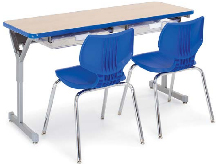
model #01361 (20"x60") shown with optional SW tote trays and 18" Flavors Stack chairs model #11849

The FRAME is attached to the pre-drilled holes in the top with (12) #10 x 3/4" screws through a 3"W x 18"L 14-gauge steel mounting plate. The mounting plate is welded to (2) 1" square 16-gauge steel Y-shaped tubes which are welded to a 1 1/4" x 2" 14-gauge vertical leg support. The legs adjust in height from 24" to 32" in 1" increments. The adjustment for each leg is secured with (2) 3 3/4" -16 x .675 allen screws. All open ends on the 16-gauge tubing will be capped with color matched plastic end caps. The bases have a color matched lockable end cap/glide combination that resists tampering. The right and left leg both include Smith System patented backpack peg allowing for either inside or outside positioning. The legs are tied together for added strength with a 1" x 2" 14-gauge steel crossbar that supplies a rigid, long lasting piece of furniture.