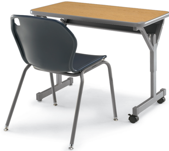
model #01368 (20"x36") shown in Golden Oak laminate, Platinum edge and Platinum frame; with optional wheelbarrow style 3" casters (model #17576) for mobility.