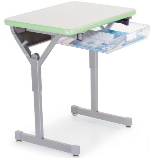
model #01360 (20"x27") single-student flex desk shown, with optional Cascade Storage tote tray w/ housing model #30926