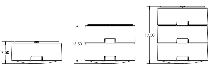
HEIGHT WITH ROCKER BASE ENGAGED (10° MOTION)