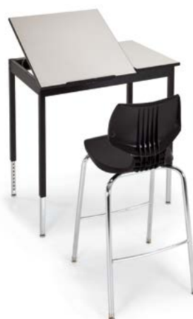
Split Top Graphic Arts Table, Model 27346. Shown in Grey top with Black edge and Black frame. Shown with optional Flavors Stool, Model 11890.