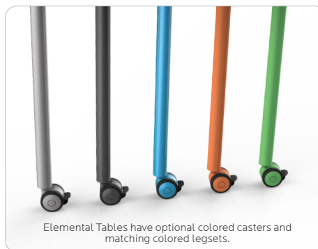
Elemental Tables have optional colored casters and matching colored legsets.