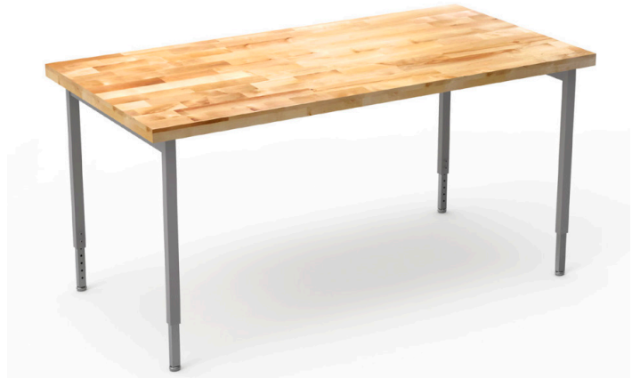
Planner Butcher Block Table Model #25521 shown with Model #17500