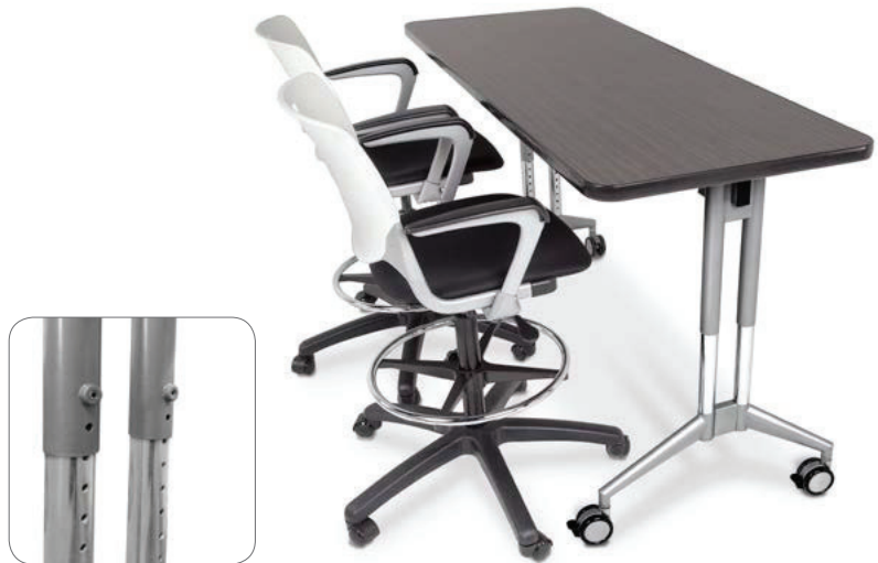
AM2460ANGRPLT Shown in Asian Night top with Charcoal edge and Platinum frame. Optional UXL Adjustable Stools.