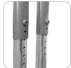
FL60HRAMEBPLT Shown in Amber Cherry top with Black edge and Platinum frame. (non-adjustable shown)