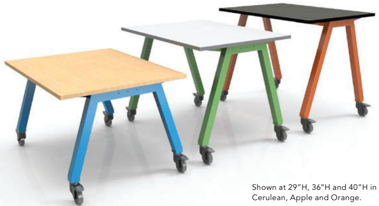
Shown at 29"H, 36"H and 40"H in Cerulean, Apple and Orange.

F 3mm Edge 1 1/4" top with 3mm flat edge. F to follow Model No.