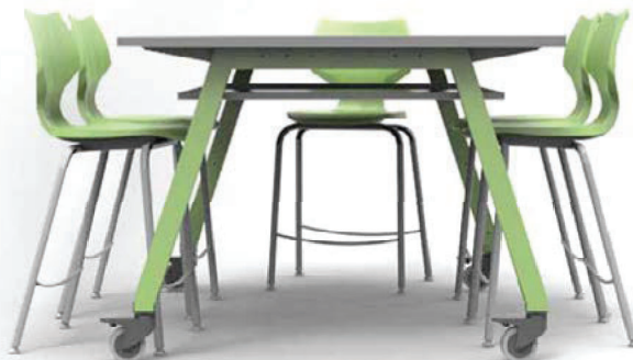
#77254, shown on #25246F (48" d x 60" w x 40" h) Planner Studio table paired with #11890 Flavors Stools (28" h).