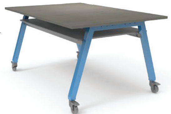
#77255, shown on #25250F (48" d x 72" w x 36" h) Planner Studio table.