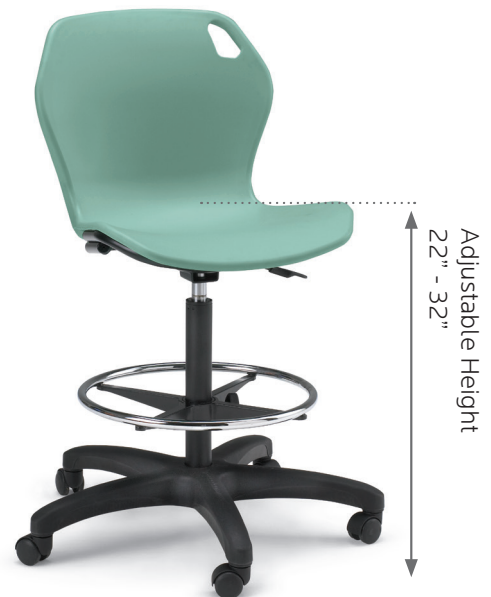
Model 00546 (glides) Model 00547 (casters) A Shell Adjustable