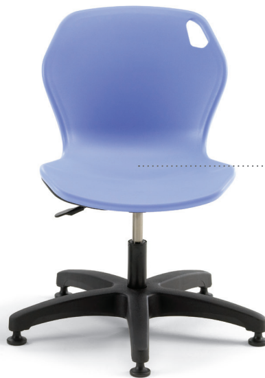
Model 00536 (glides) Model 00537 (casters) A Shell Adjustable