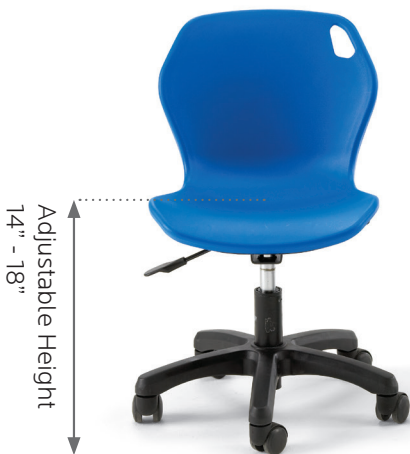
Model 00532 (glides) Model 00533 (casters) B Shell Adjustable