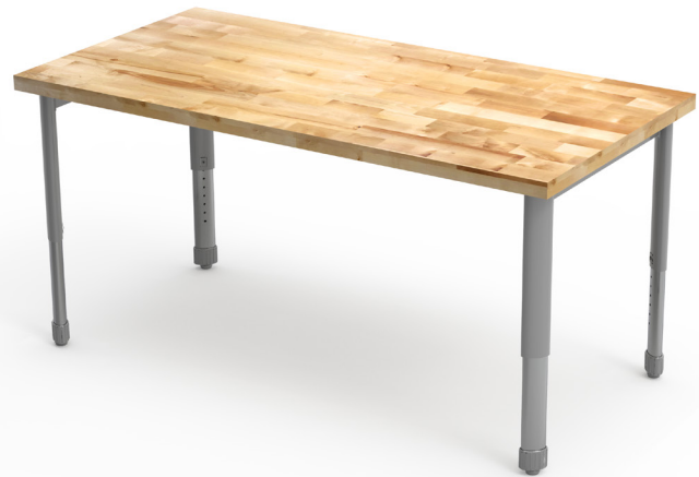
Butcher Block image shown above in BUTCHER top with Platinum legs at 30"h.