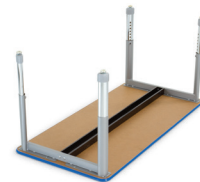
Center support channel is 2" by 3" wide 14-gauge steel, with 11-gauge steel endplates for maximum stability.