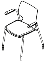
#44819U - SEAT PAD