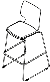
#44891U - SEAT PAD