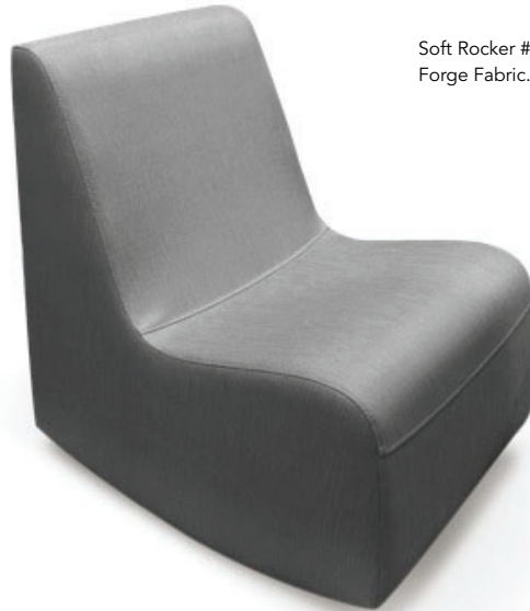
Soft Rocker #55000 shown in Forge Fabric.