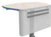
Model 76517 * Modesty Panel / Privacy Screen

Product Dimensions: 1.5" d x 23.625" w x 13.75" h Freight Class: 40 Cube: 1.44 Carton Dimensions: 13.75" d x 26" w x 1.5" h Weight: 5 lbs.