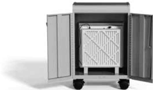
Cascade Air shown with open doors and HEPA filter.