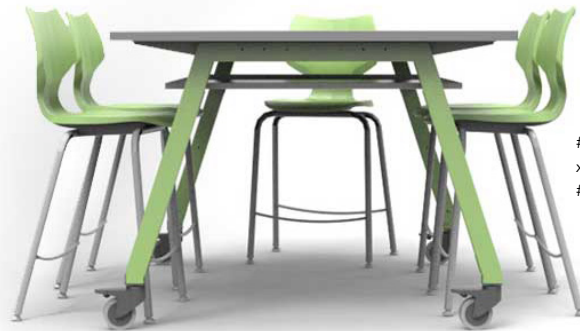
#77254, shown on #25246F (48" d x 60" w x 40" h) Planner Studio table paired with #11890 Flavors Stools (28" h).